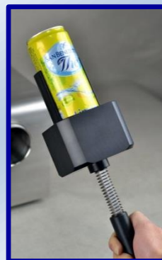
Custom-made handle for smaller size of can