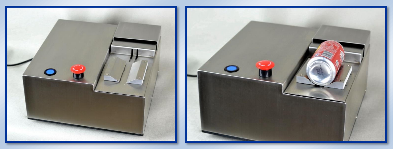
SS-1 Seaming Cutting Saw

SS-1 Seaming Cutting Saw is a specially designed saw for seam cutting purpose. Equipped with linear guide rail, cans' moving during cutting will be very precise and accurate in track. Comparing to typical seam saw, a clearer seam section will be obtained.